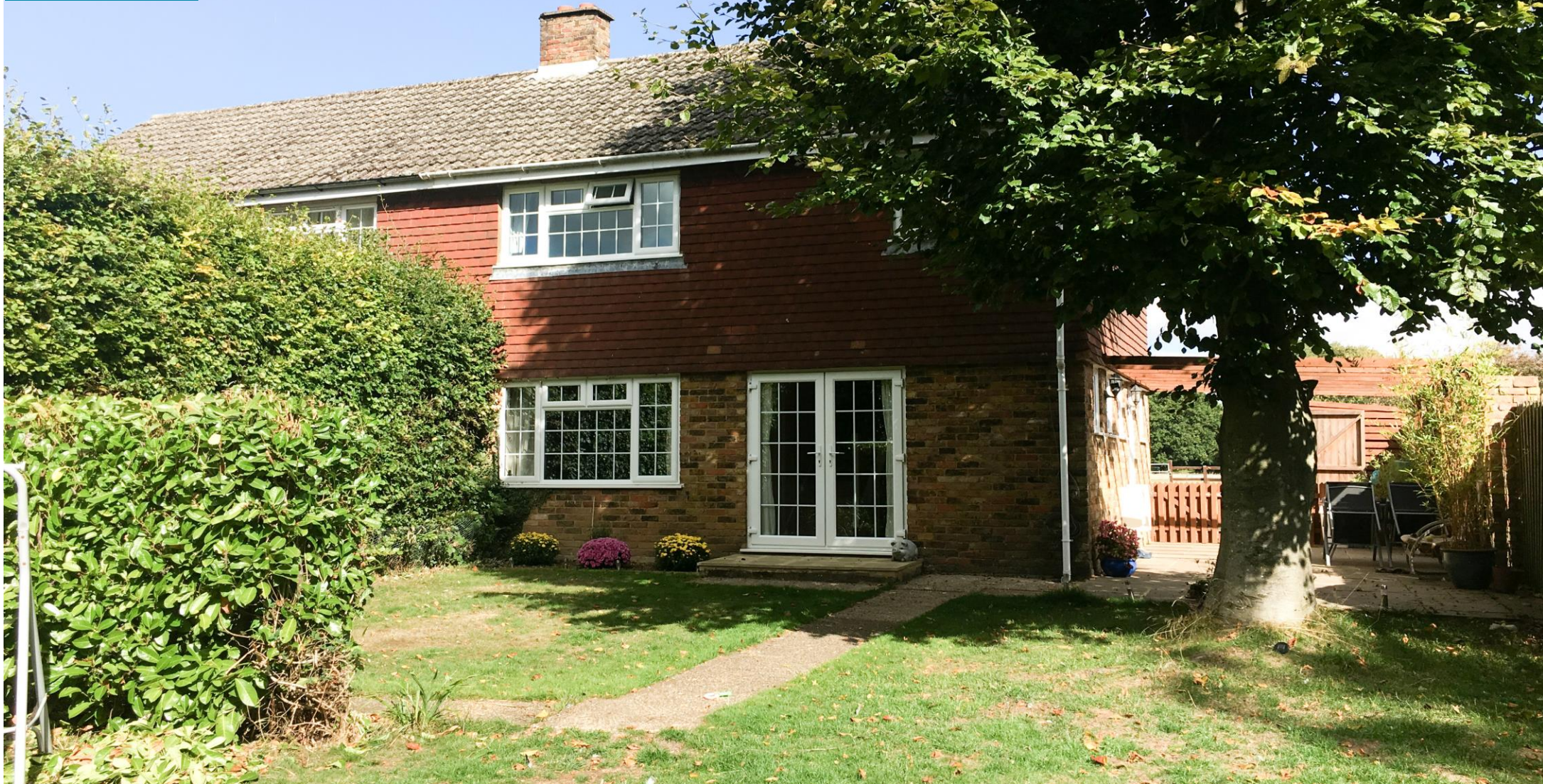
Widgeon Cottage Moat Lane Prestwood Buckinghamshire HP16 9BT